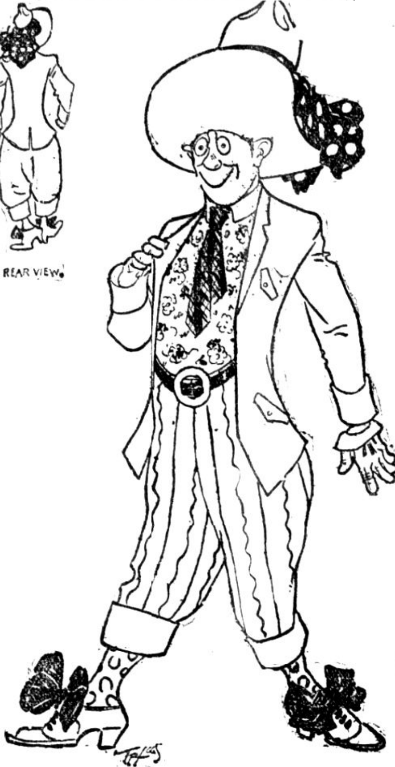
SUMMER MAN OF 1907.