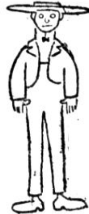
SUMMER MAN OF 1886.