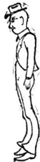
SUMMER MAN OF 1891.